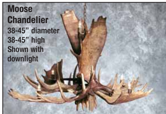
Moose Chandelier 38-45" diameter 38-45" high Shown with downlight

Looking for that one very unique item, to help enhance, complete the elegance and beauty of your home or cottage? Perhaps a special gift to pass on to a loved one or friend. Fine Antler Products can offer all this and more. Each piece is hand built using authentic big game animal sheds. Unlike the vast majority of reproductions you'll see elsewhere! Let us build you your very own, one of a kind, truly breathtaking piece of antler artwork. Call or e-mail for a complete colored catalog or simply visit our website.