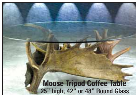
Moose Tripod Coffee Table 25" high, 42" or 48" Round Glass

See our entire line of fine antler and driftwood decor on our website.