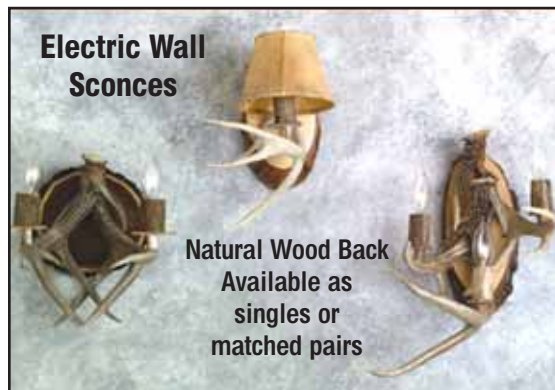
Electric Wall Sconces