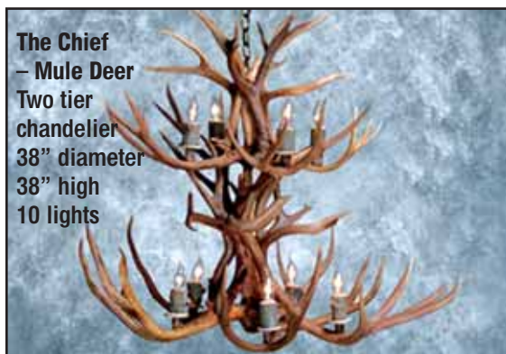
The Chief - Mule Deer Two tier chandelier 38" diameter 38" high 10 lights